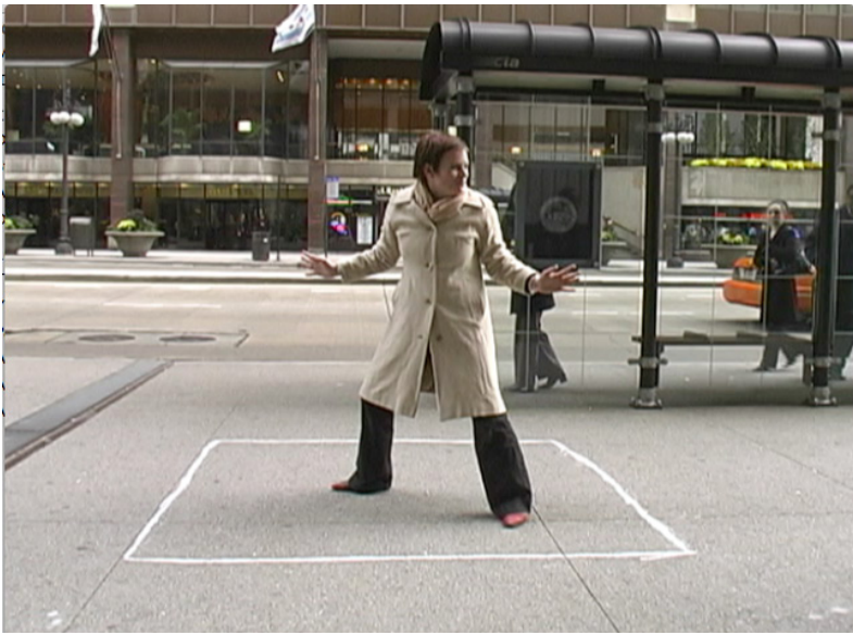
The Square (After Roberto Lopardo) [Still], 2004, Video Image Courtesy of the Artist

question of piercing false constructions, than embracing them for unexpected insight. By re-routing the circuitous platitudes of innuendo, metaphor, and the unsaid into explicit territory, McElroy rewrites social script by realizing its suggestion.