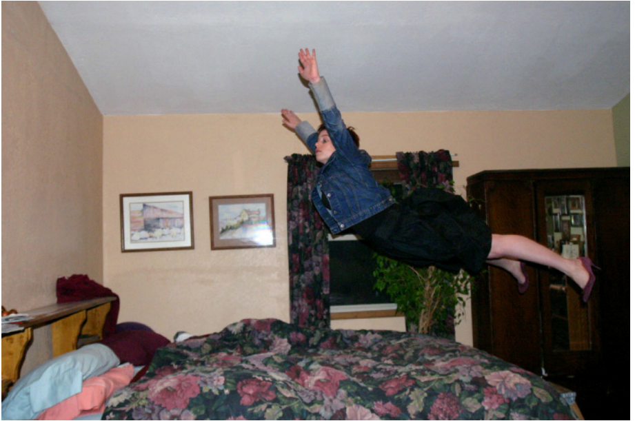
Into A Bed, 2006, Lambda Photograph