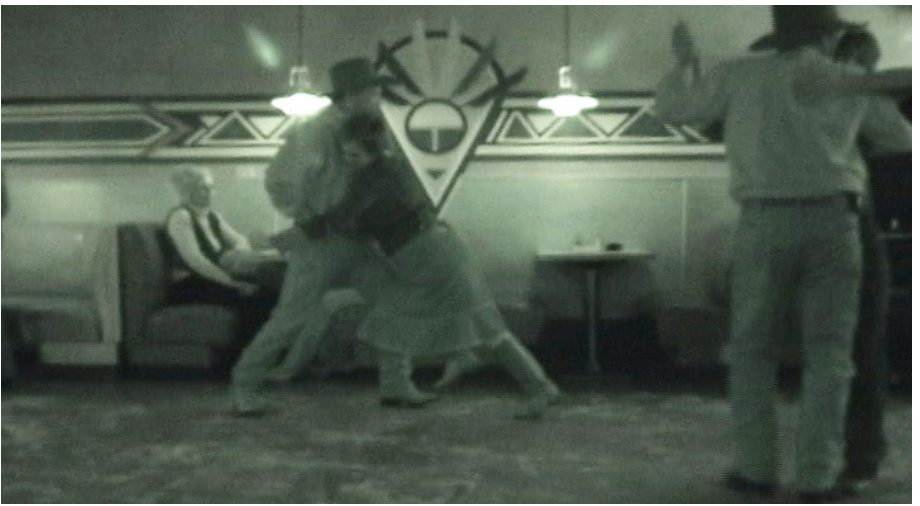
Pushing Cowboys [Still], 2004, Video