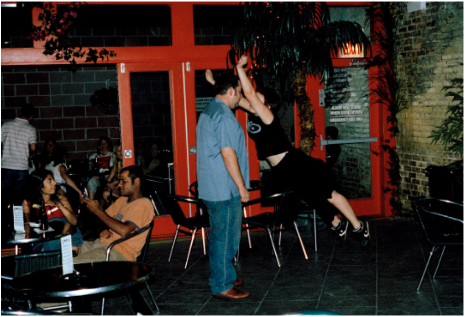
I Throw Myself at Men #10 , 2007, Digital Photograph

am genuinely trying to connect with people.” Across the inherent flubs, rejections and unexpected intimacies that follow, she orchestrates sincere portraits of bonds broken and made.