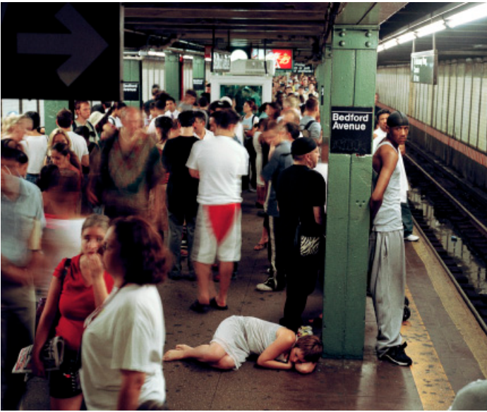
Locations (Bedford Avenue), 2004, C-Print