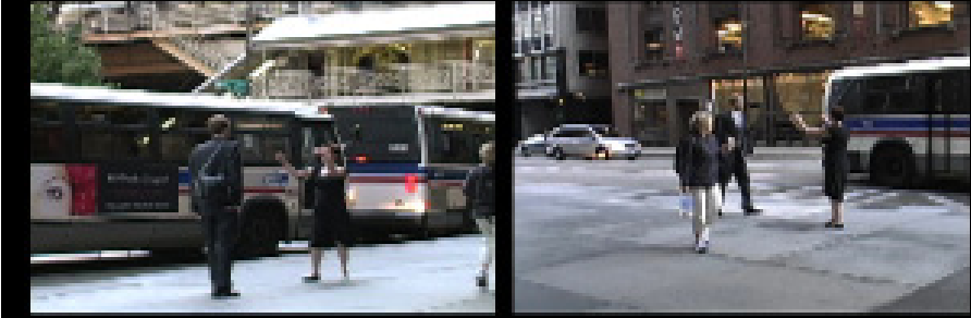
Hugs [Still], 2005, Video Image Courtesy of the Artist

simplified) in isolation. Courting ambivalence in emotion, she elaborates: “I am interested in actions that can signify more than one thing; behaviors that are simultaneously loving and cruel.”