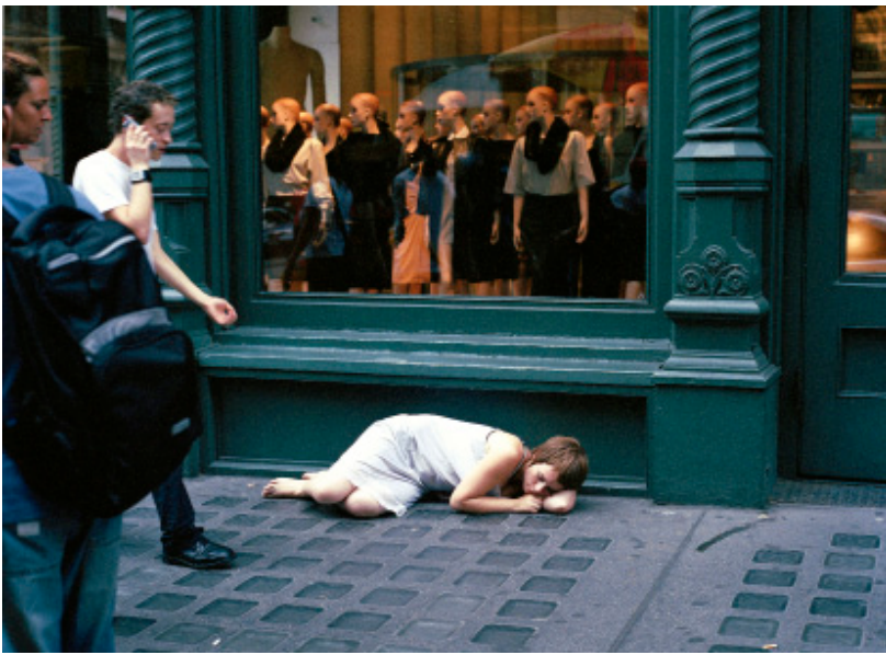
Locations (Prada) , 2004, C-Print

documentation is the action made literal . They are the artifacts of acts designed to escape the museum, and yet many of these photos now inhabit the institution. In the process, these images have become a conflicted token for those preferring that performance live on as memory, mythology and story. But what happens when such actions (and more specifically, interactions) are designed for the camera? Akin to artists like Nikki Lee and Larry Clark, McElroy exercises the “magic power of the literal” on the shorthand/cliché that is performance documentation. Whether photo or video, infrared camera in a country western bar, movie camera on the sidewalk, or snapshot flash in a shady saloon, she runs headlong into this polarizing discourse to turn it back upon itself.