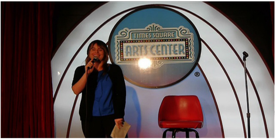
2009 was a Rough Year (Stand-Up Comedy), 2009, Performance